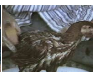
Left: Zhang Peili, WATER— Standard Version from the Dictionary Ci Hai, 1991, singlechannel colour video, 9 mins. 35 secs. Courtesy of the artist.

Middle: Zhang Peili, 30 x 30, 1988, single-channel colour video, 9 mins. 32 secs. Courtesy of the artist.