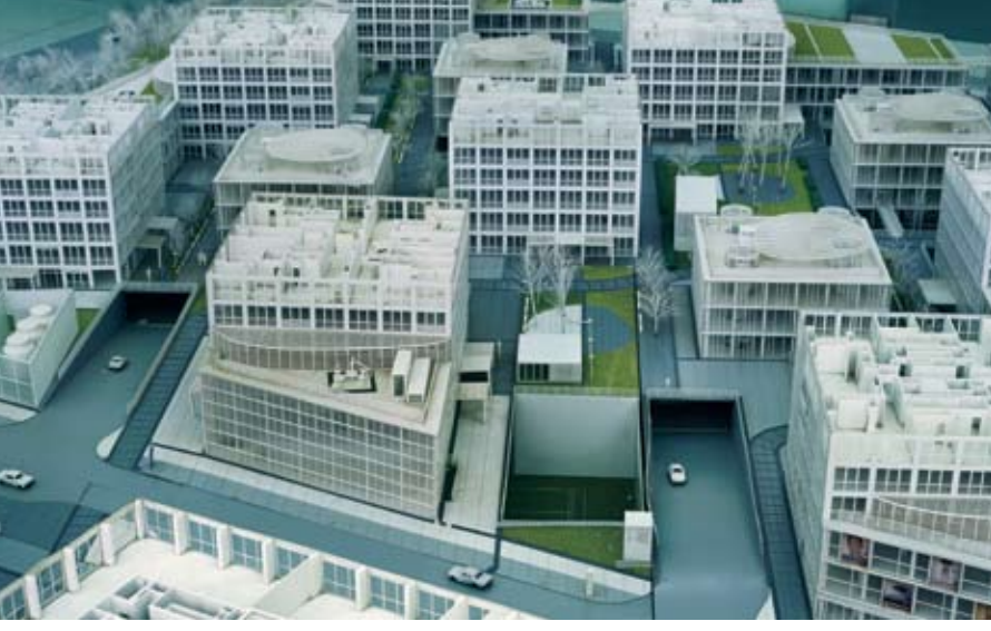
Left: Xing Danwen, Urban Fiction, Image No.13 (detail), 2005, digital photograph, 219.4 x 170.1 cm. Courtesy the artist.

Right: Xing Danwen, Urban Fiction, Image No.13 , 2005, digital photograph, 219.4 x 170.1 cm. Courtesy the artist.